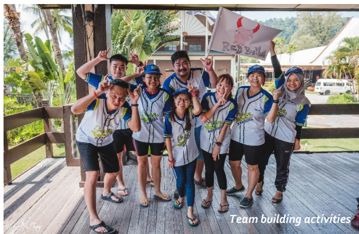
Team building activities

KISB volunteers collaboration with Berjaya Tioman Resort Environment program was appreciated with the donorship of 5 plates which will be used to replant corals in the Tioman ocean. Hopefully we can return someday to see these corals grow and provide living space to the ocean's nature and wildlife.