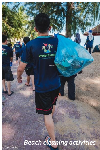
Beach cleaning activities