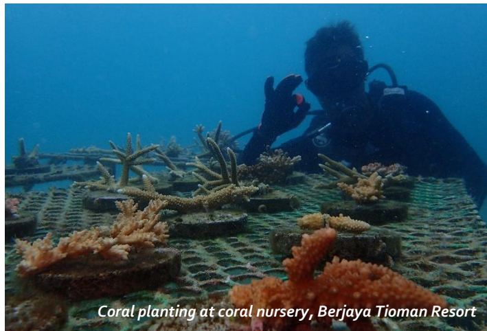
Coral planting at coral nursery, Berjaya Tioman Resort

Corals are rescued and placed at the coral nursery to recover. Cement plate is used for coral planting by letting the corals to grow naturally on it. Once the coral shows healthy and positive growth, the coral will be transferred back to the natural reef to grow so that the damaged reef site can be recovered. The survival rate of the coral very much affected by the wave or current, algae growth and irregular water temperature.