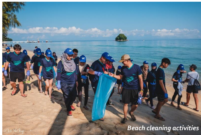
Beach cleaning activities

Efforts have been made to protect the island's biodiversity by the government and the local communities. For example, replanting corals which requires long and expensive process as well as cooperation from every parties. However, replanting corals is useless if they keep on getting damaged. Similarly, it is pointless to do clean-ups if everyone continues to throw rubbish.