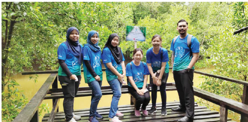
Project Smile plaque installation