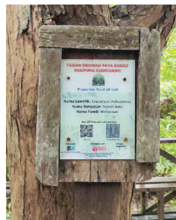
QR code on the trees for additional information

Volunteers from Kampung Sijangkang offered their help on the construction work at the mangrove forest and completed the 100 meter-long wooden walkway with the Project Smile fund support. A token of appreciation was presented to Project Smile by the caretakers and they hope to have more public support in future to allow for additional expansion and maintenance of the park.